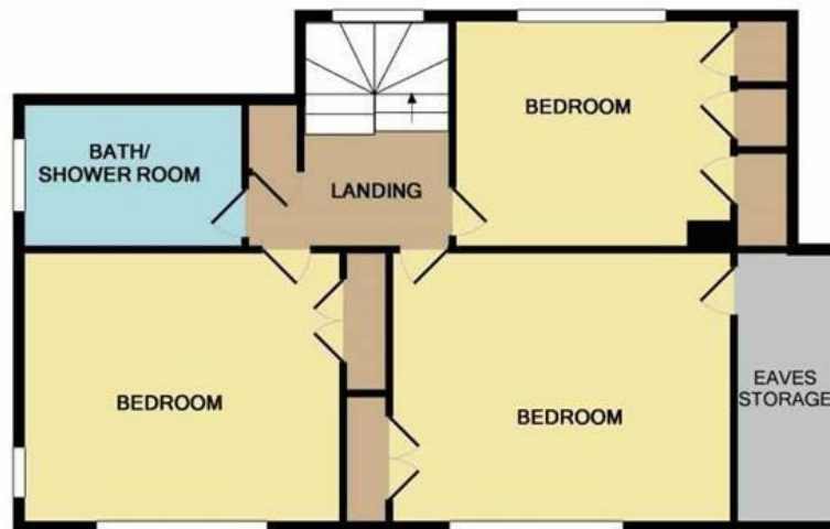
1ST FLOOR APPROX. FLOOR AREA 660 SQ.FT. (61.3 SQ.M.) TOTAL APPROX. FLOOR AREA 1400 SQ.FT. (130.1 SQ.M.)