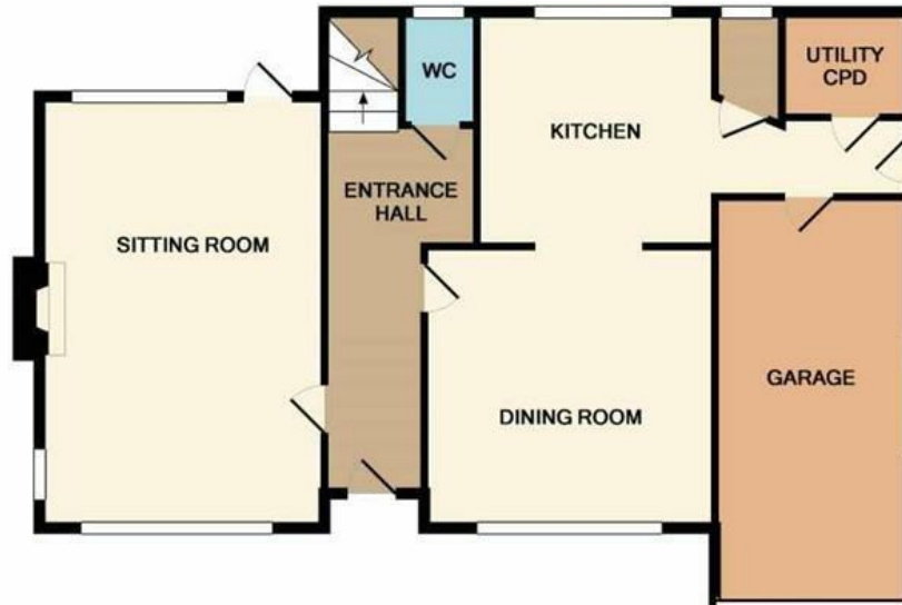
GROUND FLOOR APPROX. FLOOR AREA 740 SQ.FT. (68.7 SQ.M.)